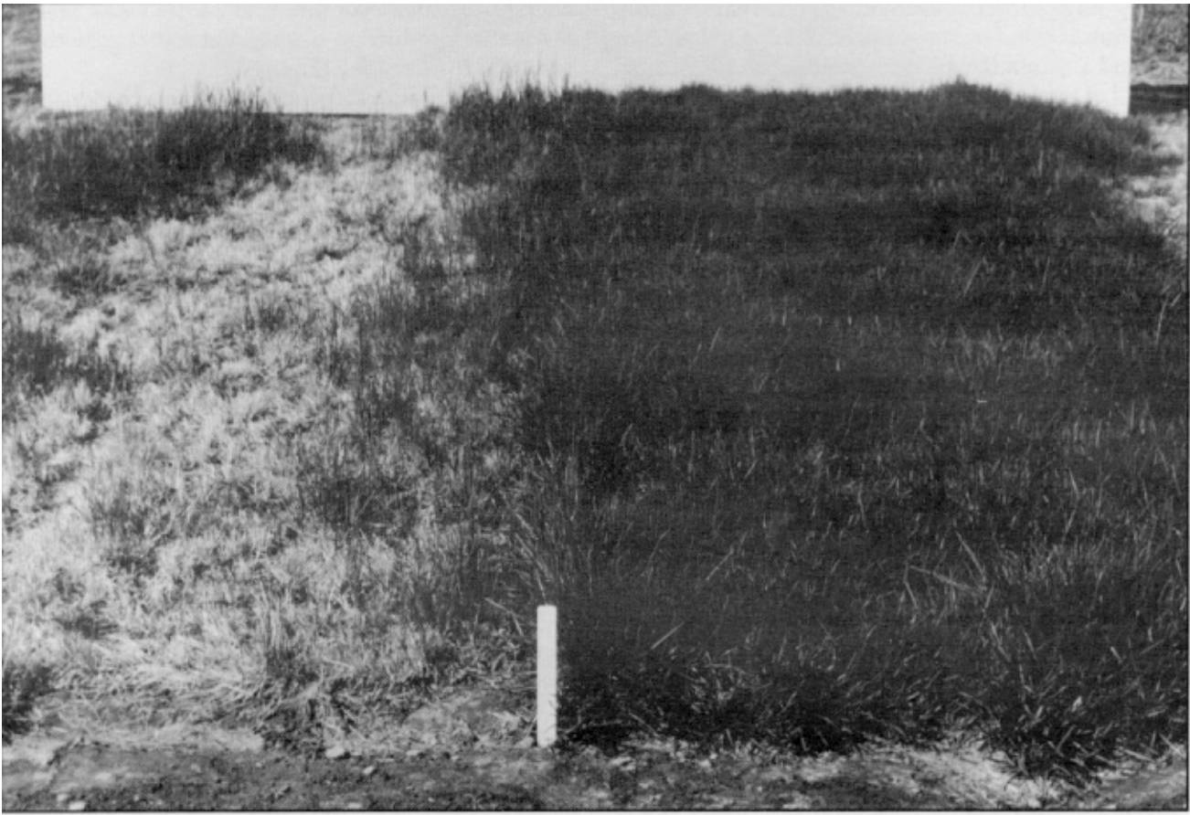
Figure 2. Comparative winter hardiness of two Kentucky bluegrass strains of dissimilar latitudinal adaptation: (left) mid-temperate-adapted Delta from southern Canada and (right) subarctic-adapted strain "412" from Iceland. Plots planted 19 June 1974; photo 5 June 1975.

postulate that auxins (growth regulators) within the plant suppress the development of basal tillers during the time of rapid culm elongation; they found high growth-regulator activity at the early jointing (culm elongation) stage and a significant drop in growth-regulator activity just prior to anthesis and preceding the period when active tiller growth resumed.