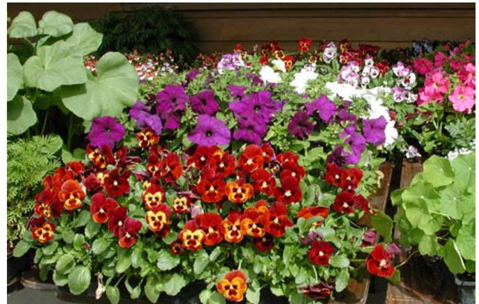
Pansies, petunias, nasturtiums, and other flowers for the demonstration garden at the Georgeson Botanical Garden.

Twilley Seeds, 121 Gary Rd, Hodges SC 29653, www.twilleyseed.com Valley Nursery, Box 4845, Helena MT 59604 Van Bloem USA, Inc., 500 Pendley Industrial Park, Cumming GA 30130 Vaughan's Seed Co., 5300 Katrine Ave, Downers Grove IL 60515 Vermont Bean Seed Co., Garden Ln, Fair Haven VT 05743, www.vermontbean.com Vesey's Seeds, Ltd., PO Box 9000, Calais ME 04619-6102, www.veseys.com W. Atlee Burpee & Co., 300 Park Ave, Warminster PA 18991, www.burpee.com Waushara Gardens, N 5491 5th Dr, Plainfield WI 54966 Wayside Gardens, 1 Garden Ln, Hodges SC 29695, www.waysidegardens.com West Coast Seeds, 3925 64 St, Delta BC V4K3N2 Canada, www.westcoastseeds.com White Flower Farm, PO Box 50, Litchfield CT 06759, www.whiteflowerfarm.com Wildseed, Inc., PO Box 308, Eagle Lake TX 77434