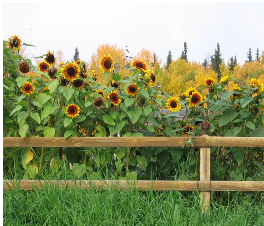
Sunflowers at the Georgeson Botanical Garden, fall 2008.

The University of Alaska Fairbanks is accredited by the Commission on Colleges and Universities of the Northwest Association of Schools and Colleges. UAF is an affirmative action/equal opportunity employer and educational institution.