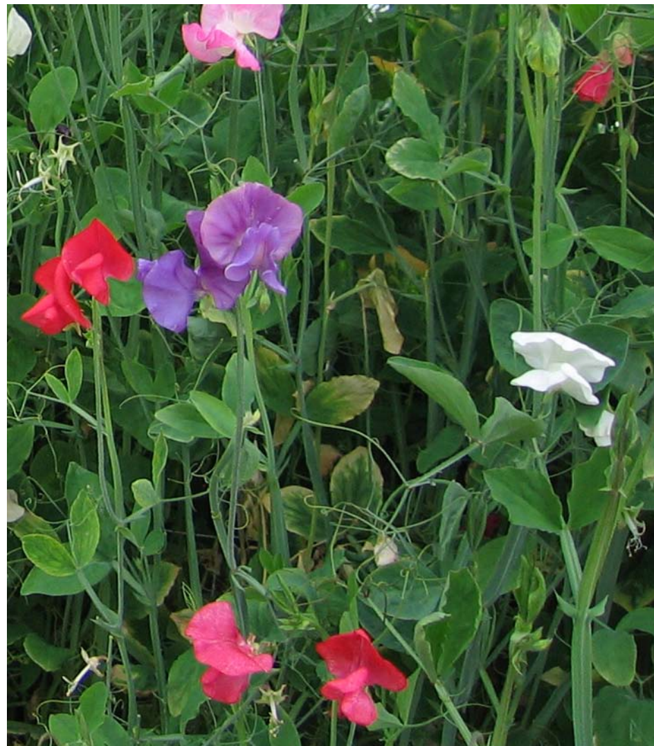
Sweet peas at the Georgeson Botanical Garden.

USDA Plant Introduction Stations, NC7, Iowa State Univ., Plants and seeds