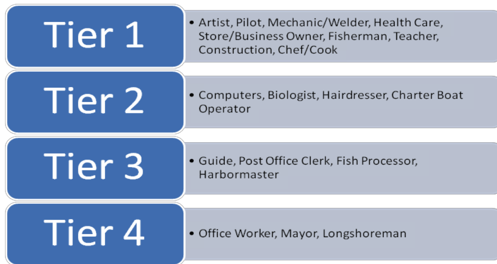
Figure 3 Coastal youth Occupational Ranking

In analysis, the data were stratified by group as a whole, by community, by gender, by ethnicity, and by sub-region. For the group as a whole, findings demonstrate a cultural affinity toward outdoor and/or vocational work, such as fishing, mechanics, carpentry, air piloting, and culinary arts, but also other self-directed work such as teaching and owning a small business. Occupations with lower ranks were perceived to be associated with a lack of personal power or boring, including: fish processing and office work. Jobs in tourism were also given a low ranking as well as mentioned previously, and work in local government was generally undesirable due to youth recognition of the heady nature of small town politics. This analysis also revealed gender differences and a marked cohesion among young women in their answers although their comments about work during the group discussions were often overshadowed by interests and preferences of the young men in the group, i.e. in which the young men overwhelmingly wanted us to know their interests did NOT include hairdressing.