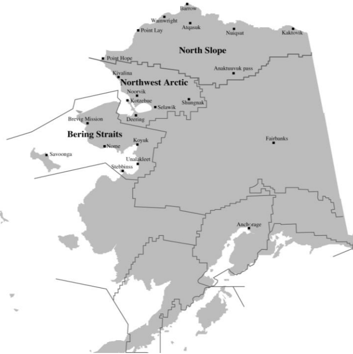
Figure 1. Map of the Study Region

It can be said, though, that culture is an essential weapon against the chaos of life and death. It is a means by which continuity from generation to generation can be ensured, and an endorsement of order and meaning. Though the lifeways of present-day Alaska Natives still resonate with the unique cultures of their forebears, social chaos permeates their lives. A sense of order and meaning, to a large degree, has been misplaced (Alaska Native Commission, 1994).