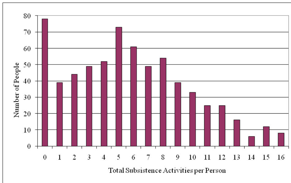
Figure 3. Count of Subsistence Activities

Because of the way the data are distributed, a censored regression is used to estimate subsistence participation. Censored models are used to analyze dependent variables that are unobserved below a bottom limit (left censored), above a top limit (right censored) or both (McDonald & Moffit, 1980). Twelve percent of all respondents reported no subsistence participation. The data distribution is shown in Figure 3.