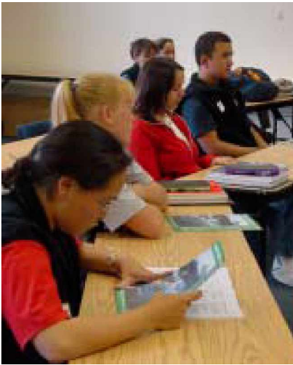
PITAS students are now meeting in Juneau.