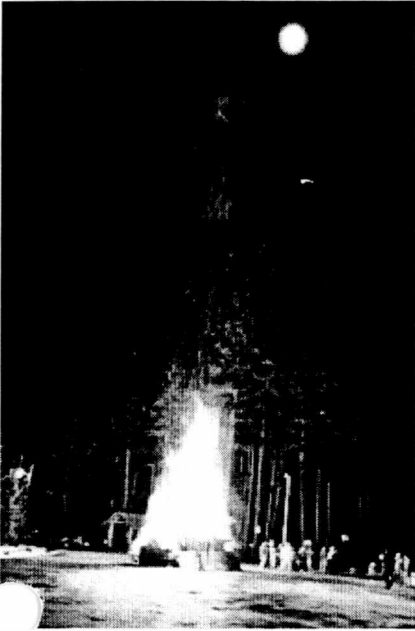
The Bonfire is tonight at 7 p.m. and the Polar Bear Plunge is Sunday at 2 p.m.