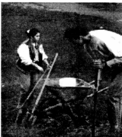
The "Thousands of Flowers" bulb planting campus beautification takes place Oct. 5.

More than 3,000 bulbs will be planted in the annual Thousands of Flowers beautification project now in its fourth year on the Juneau campus. Students, faculty, staff and community volunteers are invited to take part starting at 9 a.m., Saturday, Oct. 5. A lunch will be served following the planting.