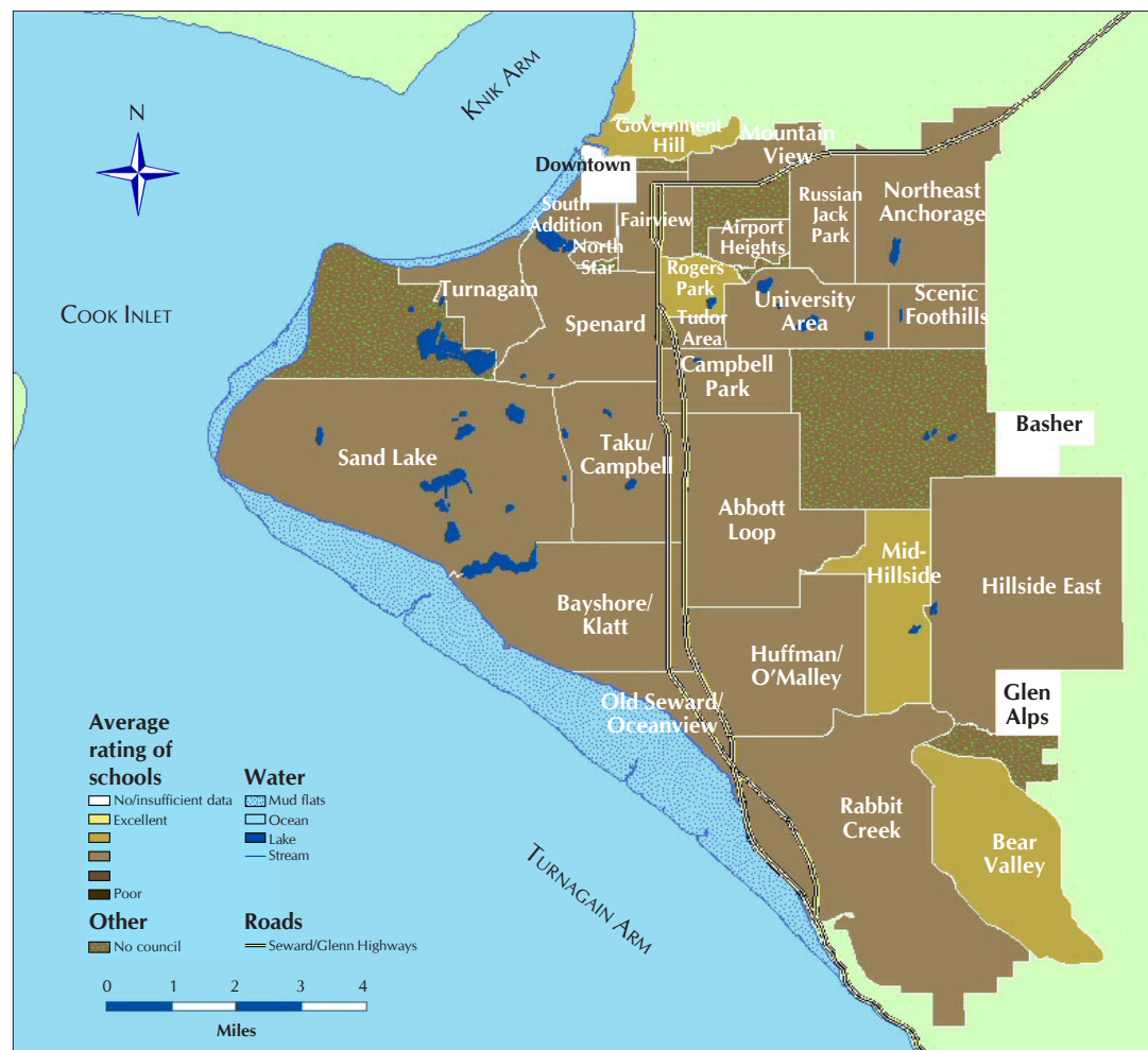
Figure 2. Anchorage