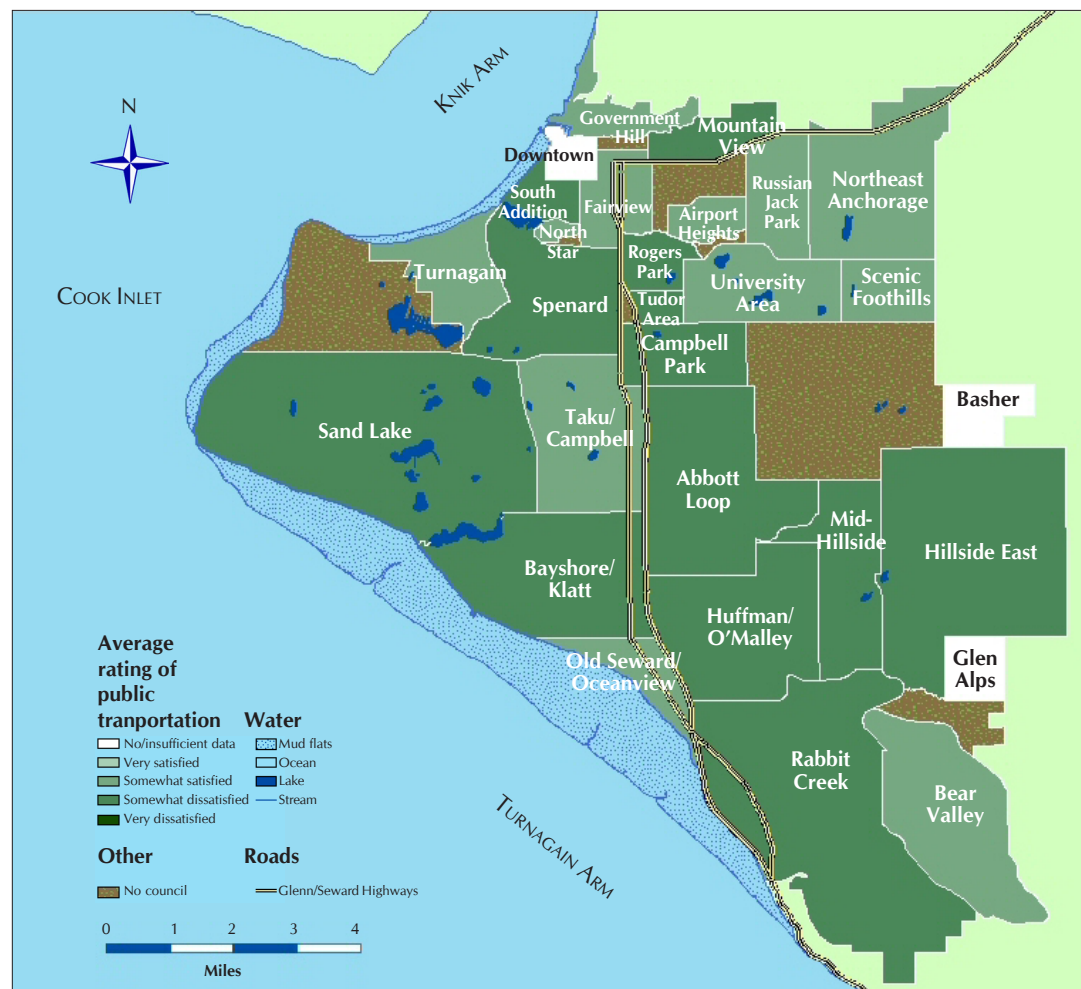
Figure 2. Anchorage