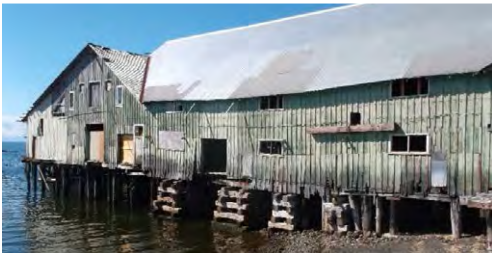
Keku Cannery, Kake.

This year, Congress authorized increased grant limits in the Brownfields Program and removed barriers to Alaska Native villages